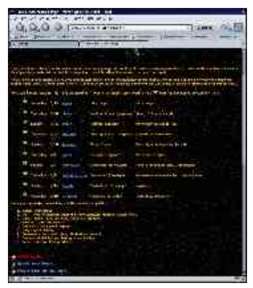
Figure 2 1996 website