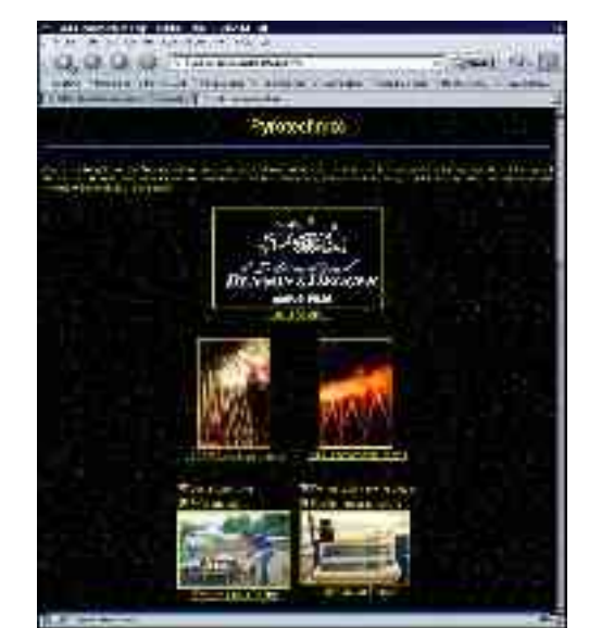
Figure 3 1998 website